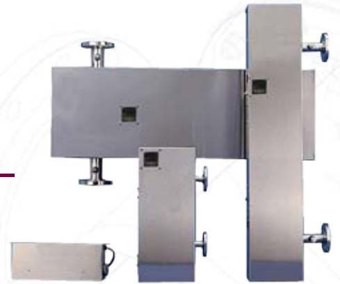
SP & SL Series

Note: No options are available on SP models